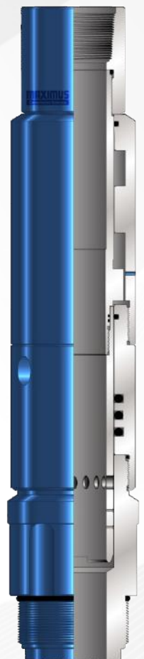
W8 Circulating Valves