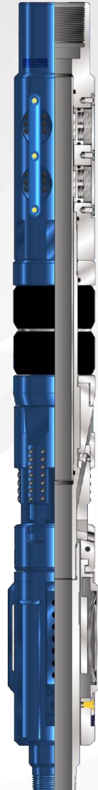
Magnus RTT Packer