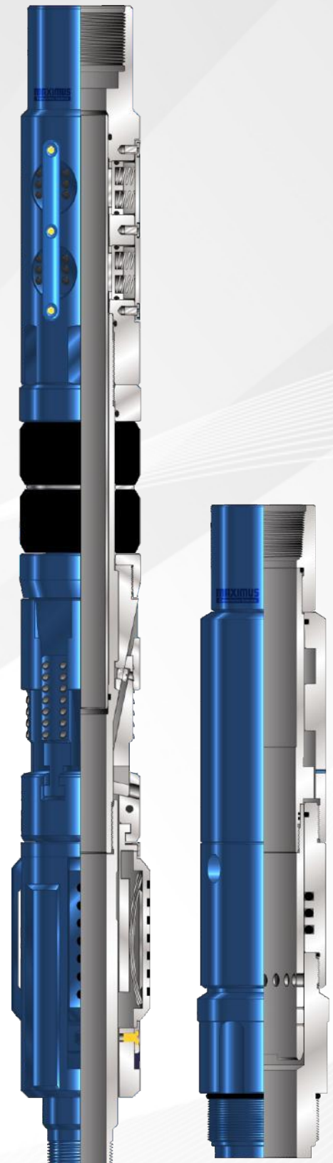
Magnus RTT Packer