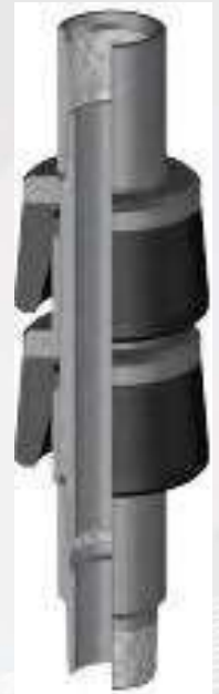
2 Cup version