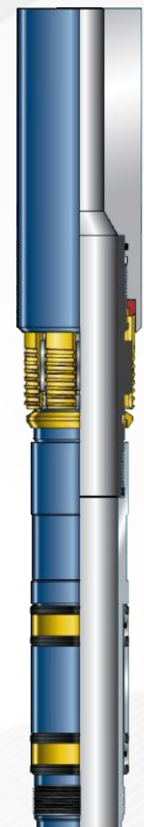
Shear-type Anchor Latch

Several sealing options are available from molded Nitrile seals to RTR, VTR, TKM, PEEK, RKTR enabling sealing to 10,000 Psi., and temperature ratings to 450 degrees F.