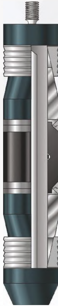
Cobra Slim Cap Wireline Set Slim Bridge Plug